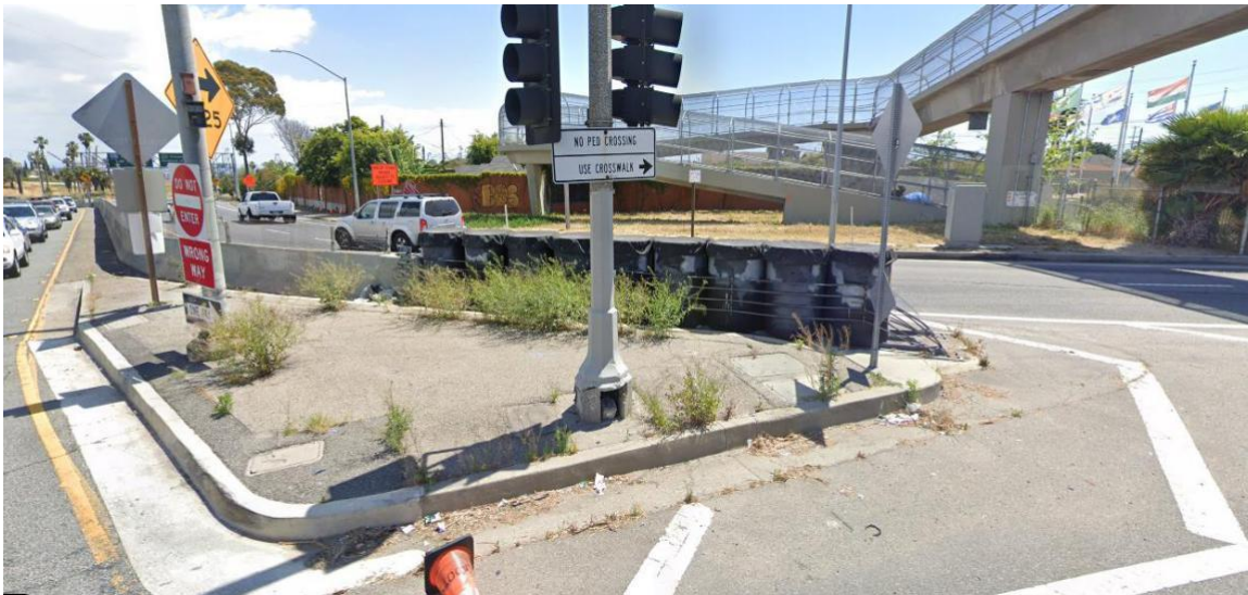
Figure 9. Median between 110 on ramp and terminus.