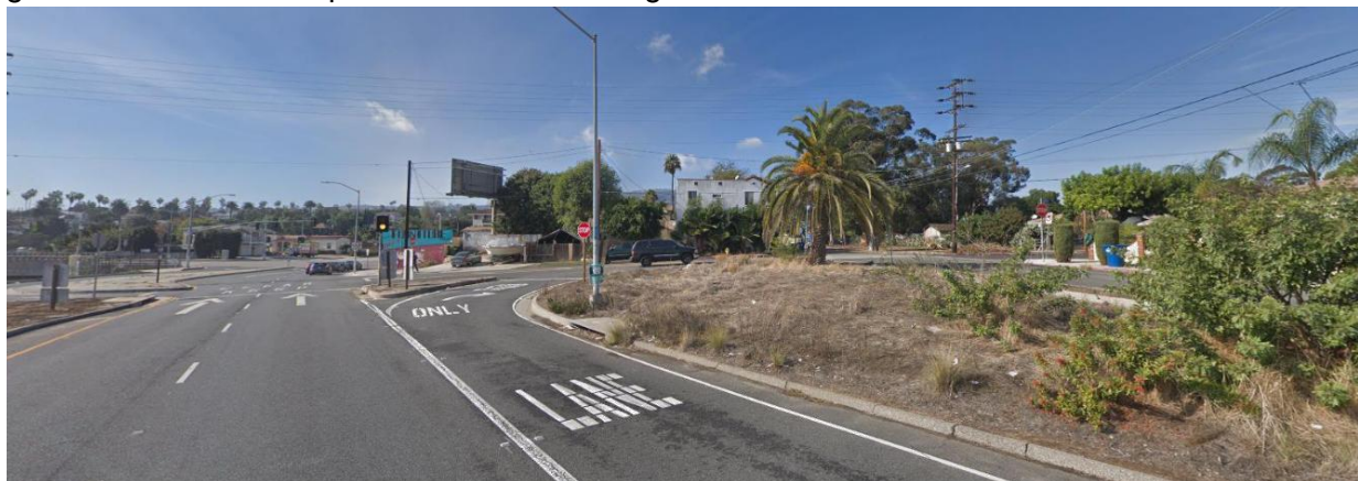
Figure 10. Medians and public land surrounding the 47 terminus.