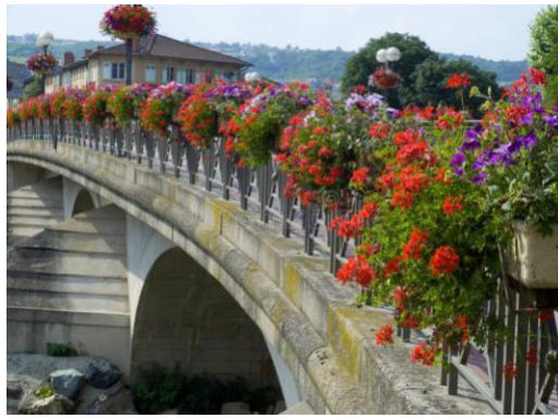
Figure 13. Flower-covered bridge in France.