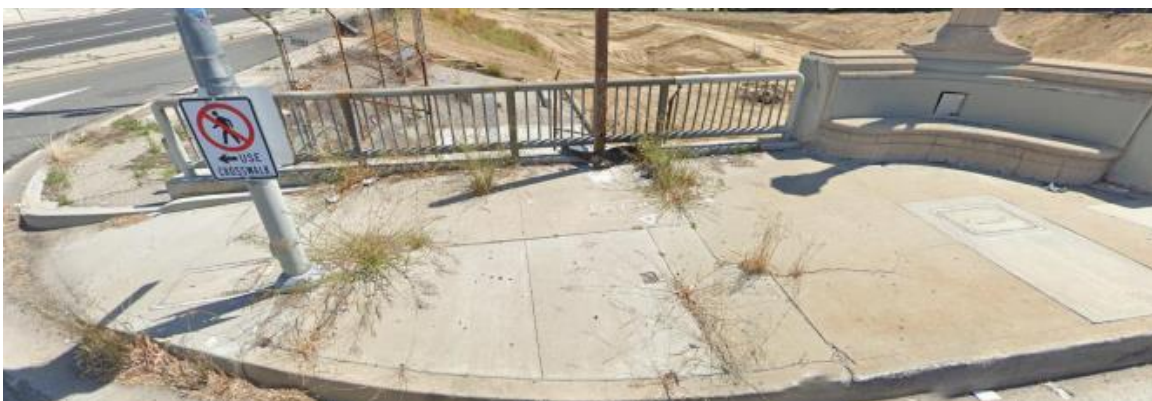
Figure 7. Gaffey Street Bridge, east sidewalk.

The adjacent public land north of the 47 terminus, the medians surrounding the terminus of the 47, and the sidewalk areas in general are unkempt and unimproved if not overgrown with weeds. See figure 7-10.