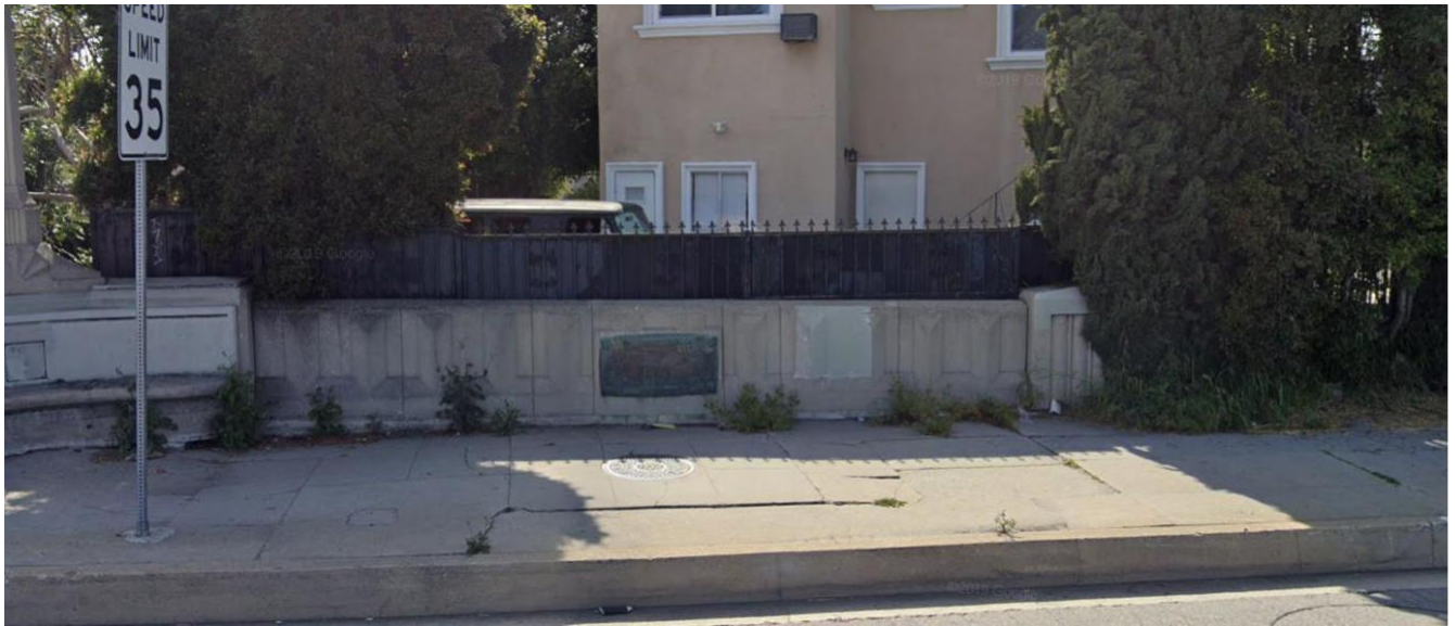
Figure 8. Gaffey Street Bridge, west sidewalk